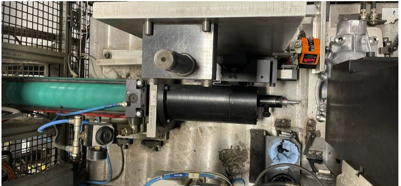
Figure 2 - Press station

The station is first loaded by an operator who loads the vent tube and housing to their respective fixtures. RTV sealant is applied to the vent tube while it is rotated by a geared rack on a pneumatic cylinder. The vent tube is then inspected by a camera system and pressed into the housing by an air-oil Tox press.