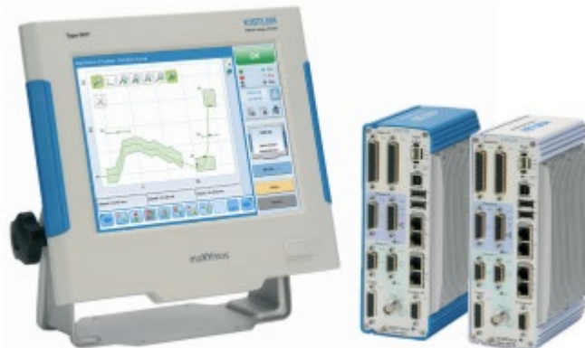
Figure 4 - maXYmos TL

GKN will provide the purchased components (maXYmos system, sensors) and will be able to assist the team with component selection recommendations. GKN will provide mechanical and electrical drawings of the station to be used as a basis for the design of the retrofit kit.