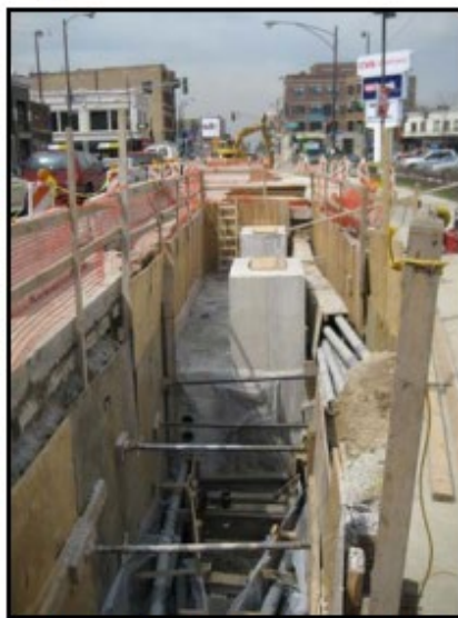
Figure 4 Vault Construction