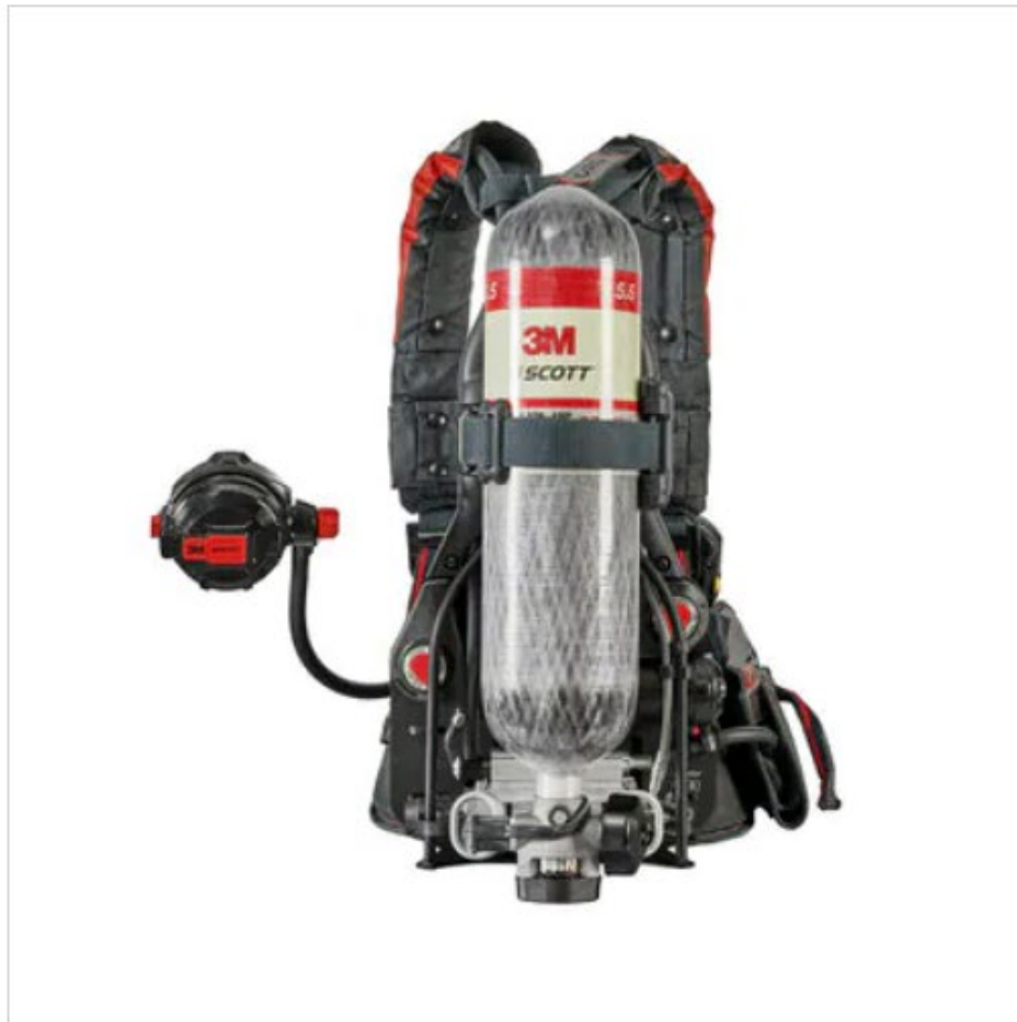
3M™ Scott™ Air-Pak™ X3 Pro SCBA with 3M™ Scott™ E-Z Flo C5 Regulator - Front

Headquartered in Monroe, North Carolina with corporate offices in St. Paul, Minnesota, 3M|Scott Fire and Safety generates >$500M in revenue and employs about 500 people in Monroe.